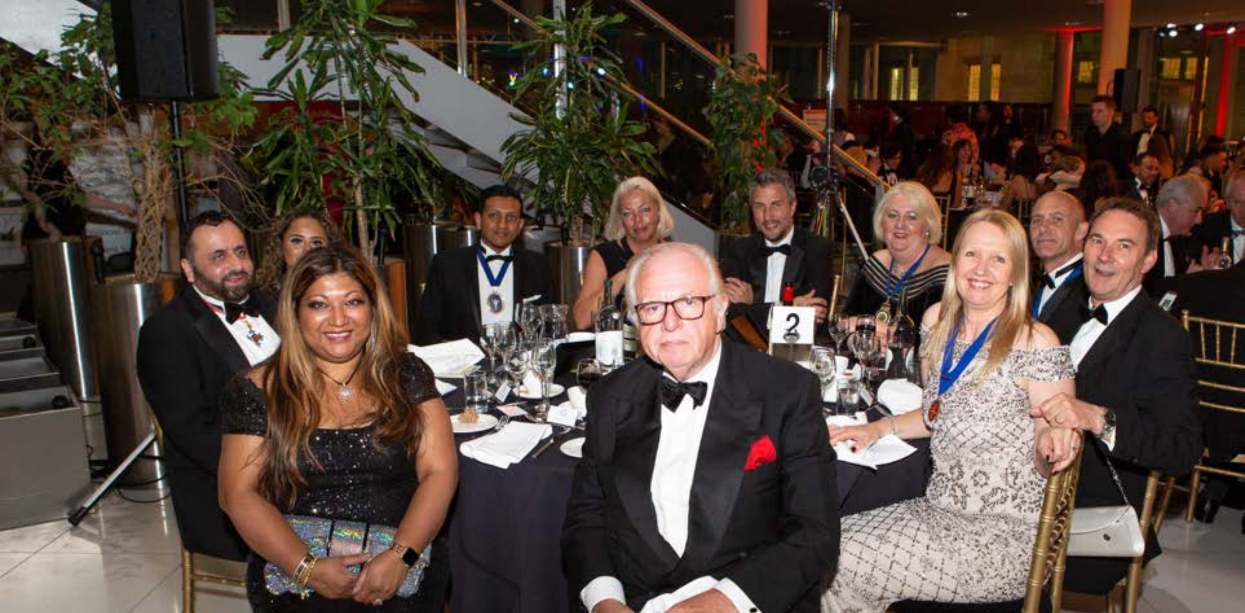
Vice President's Table