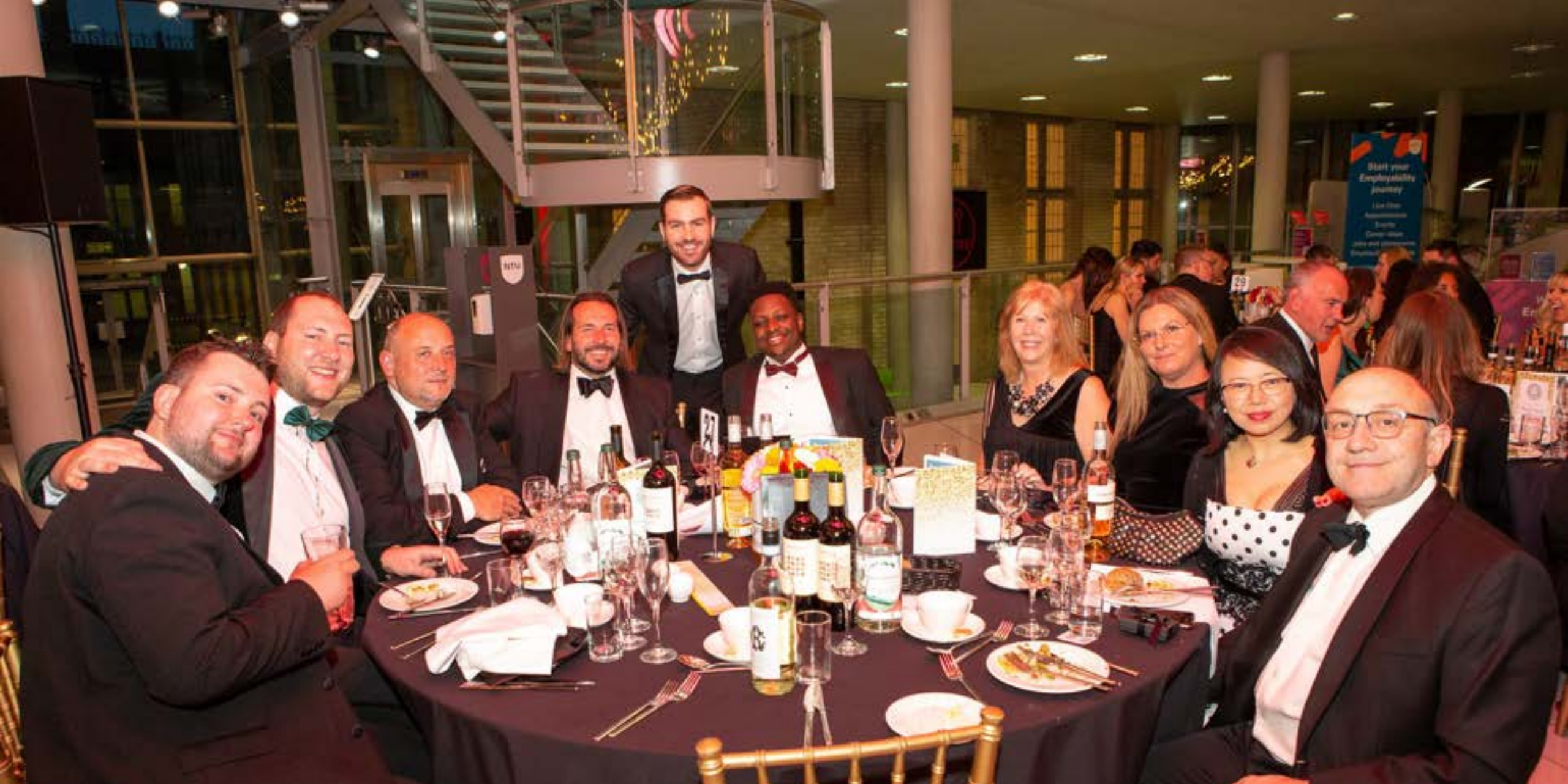
Quartz Barristers Chambers