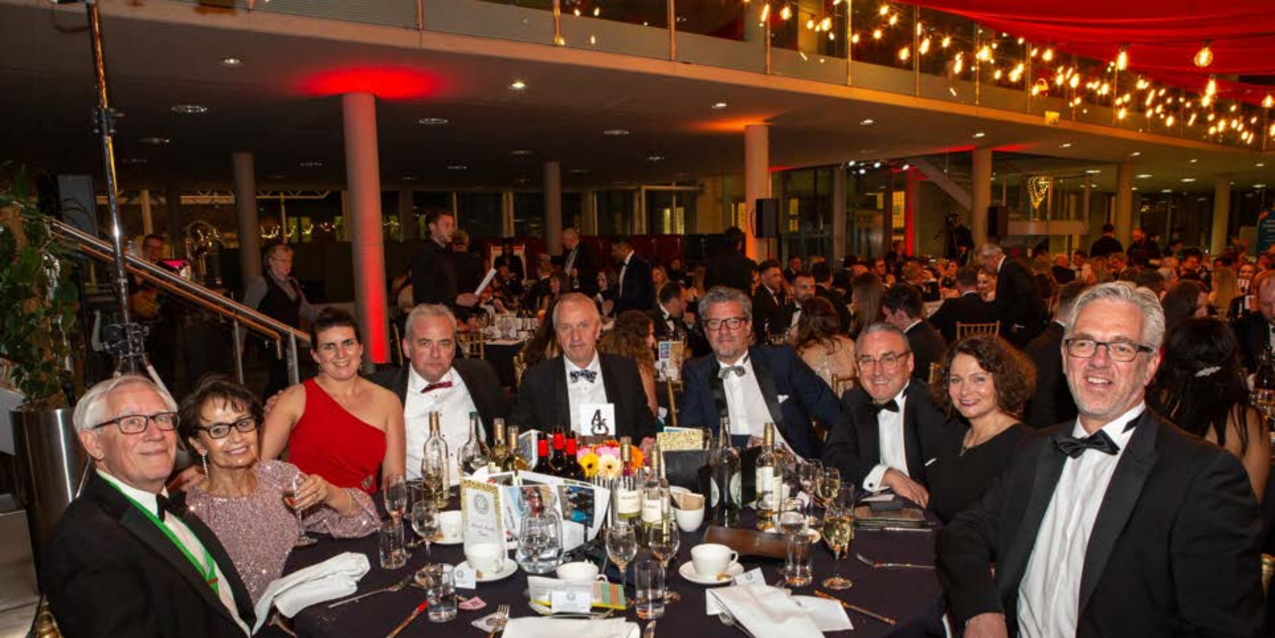
International Guests from Karlsruhe & Ghent & Past Presidents'