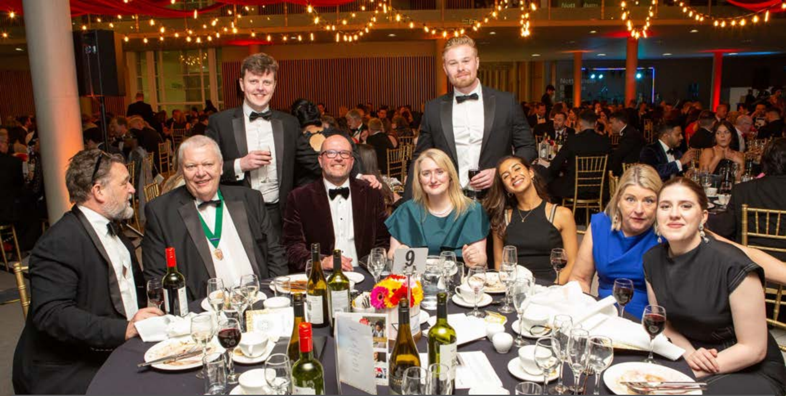
No. 1 High Pavement Chambers