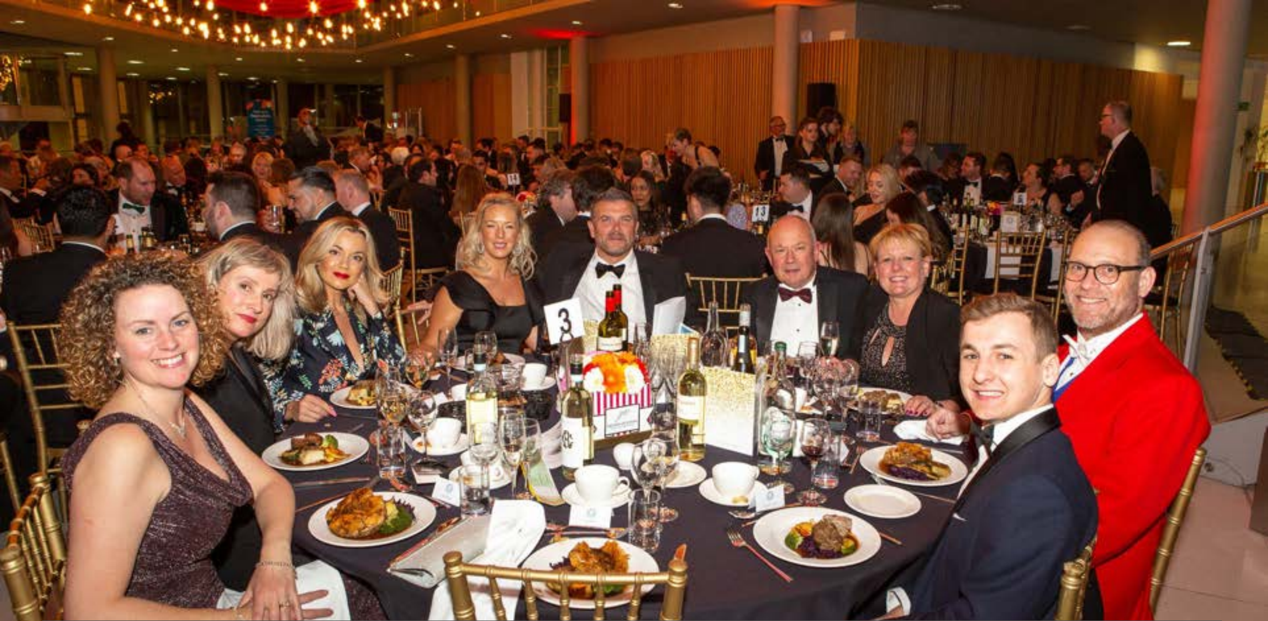
Nottinghamshire Law Society & Guests