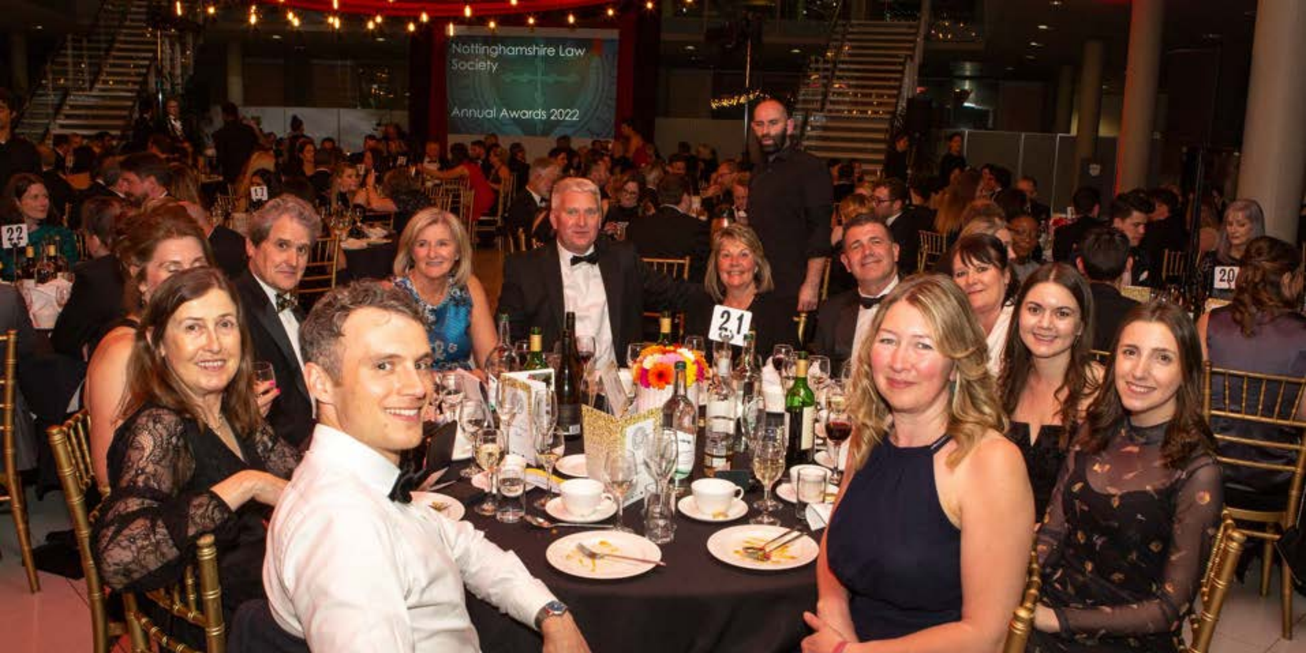
John Hooper & Co, Office Team, University of Law