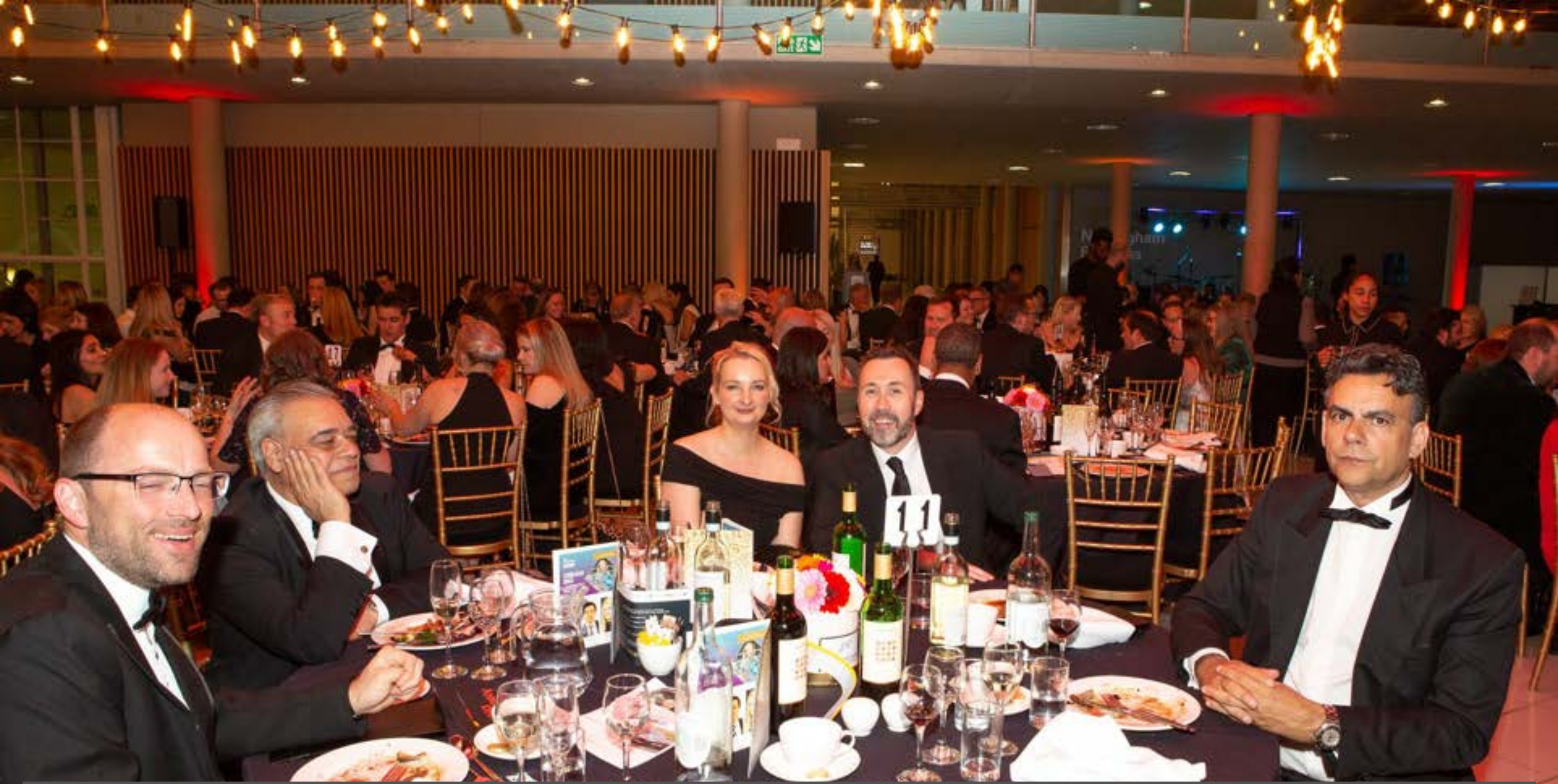
MARSH Speciality & Guests