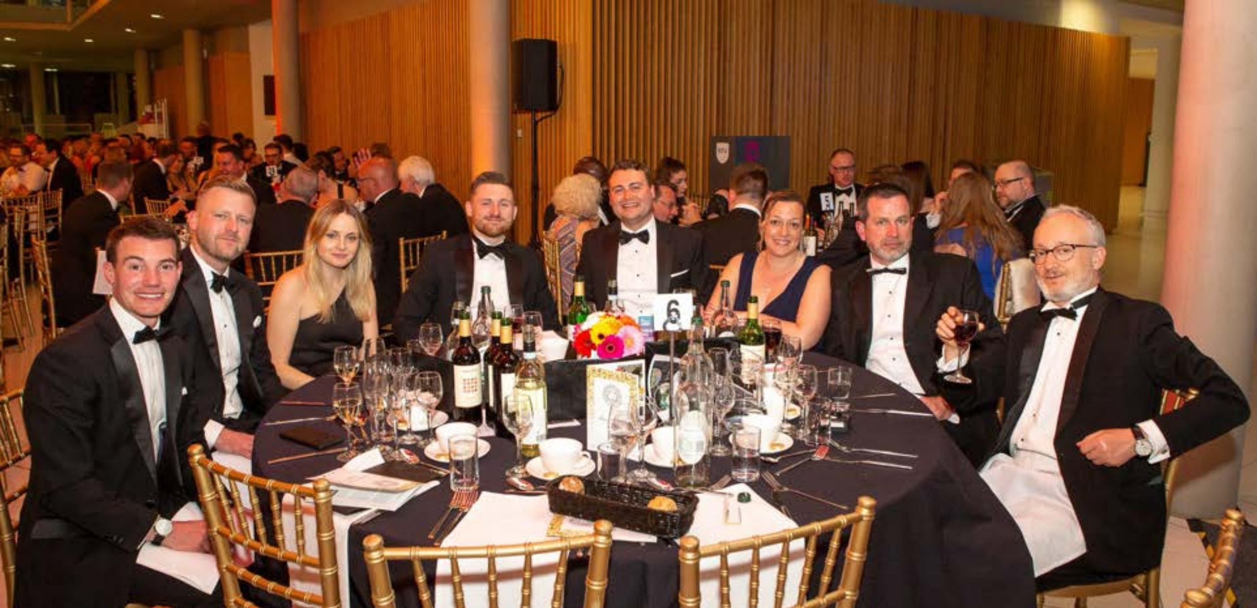
Brewin Dolphin & KCH Garden Square