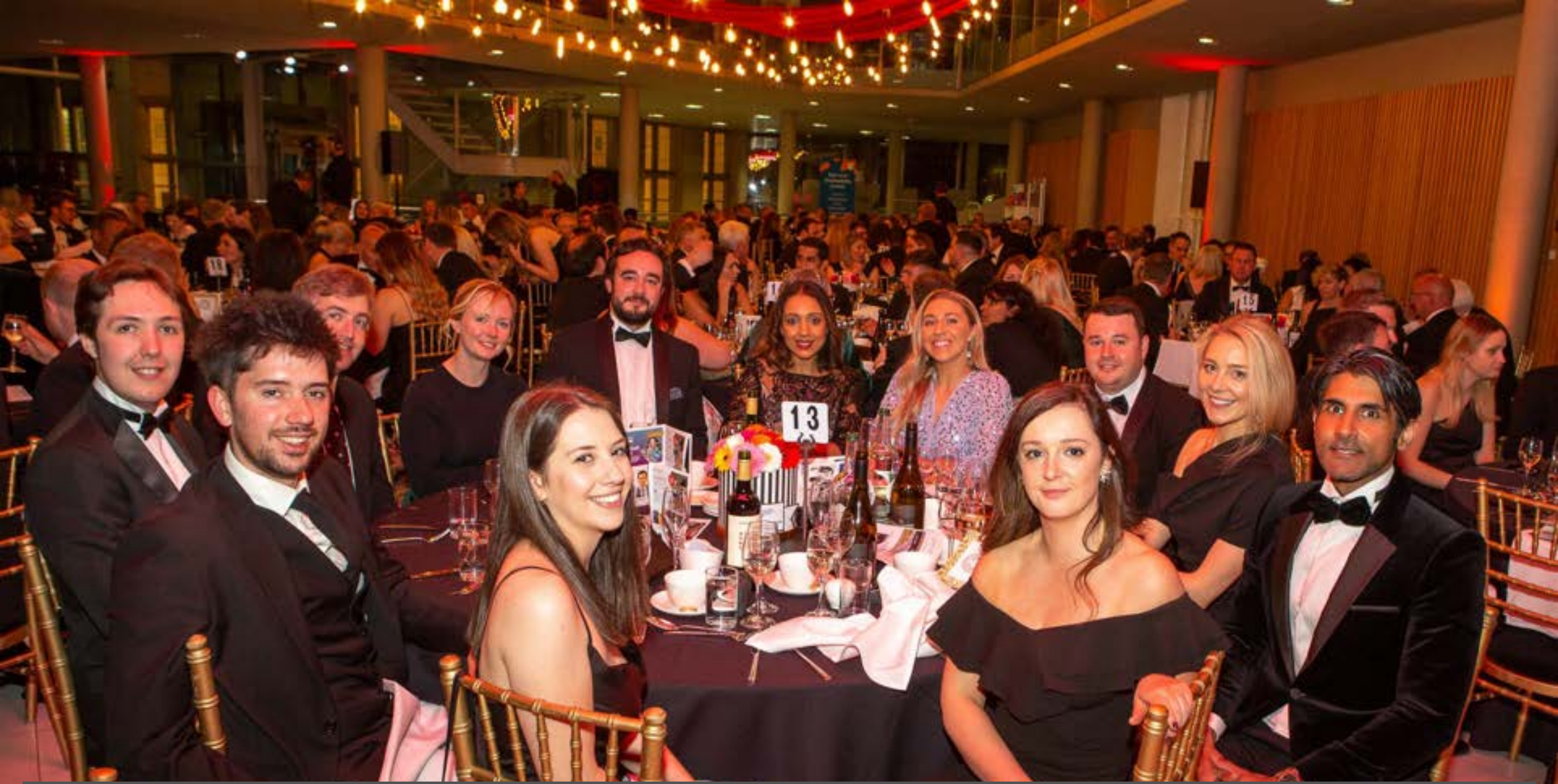
Ropewalk Chambers & Guests