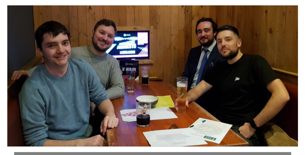
Ropewalk Chambers - The Ropewalkers