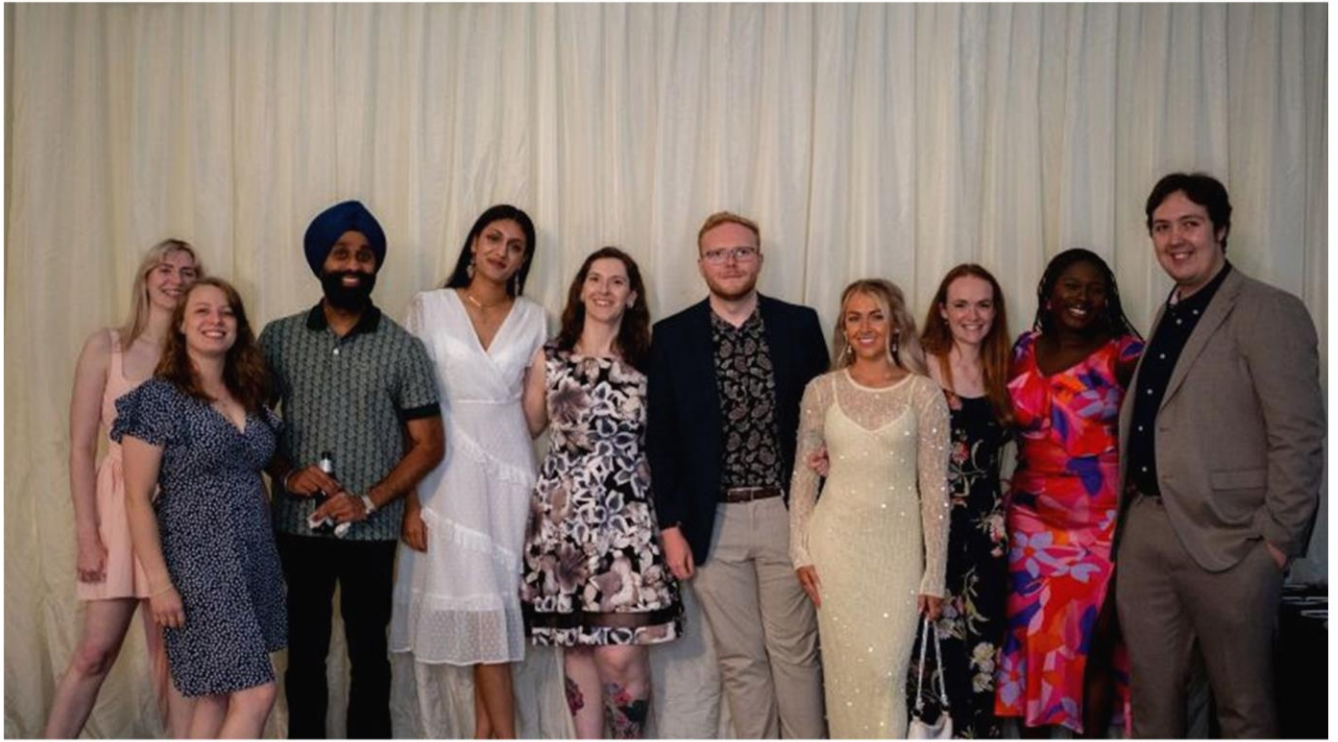
The NJLD Committee