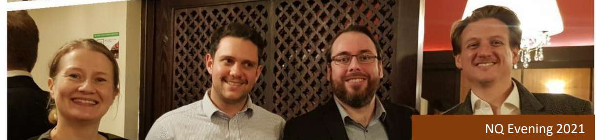
NQ Evening 2021