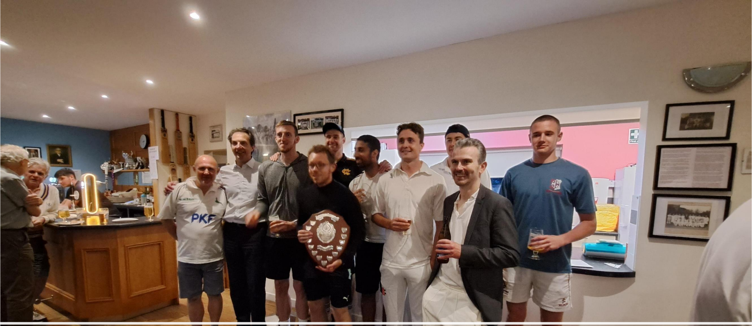
Derby & District Law Society – Battle of the A52 Cricket Team Winners 2023