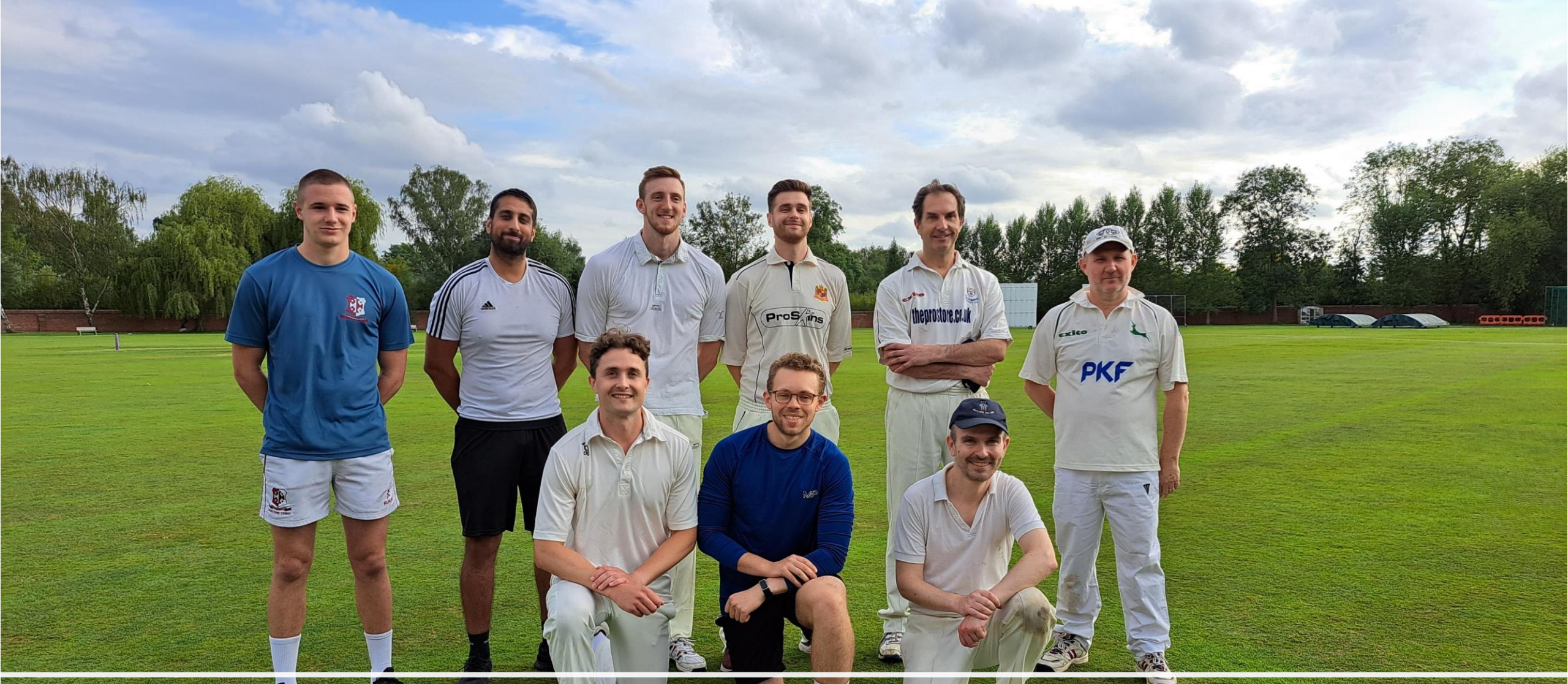
Derby & District Law Society – Battle of the A52 Cricket Team