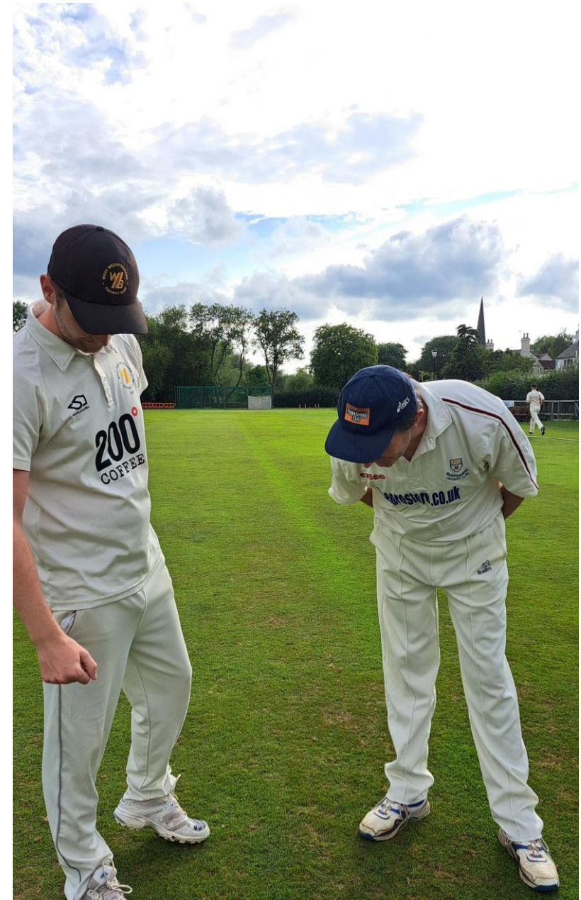
Derby to field...