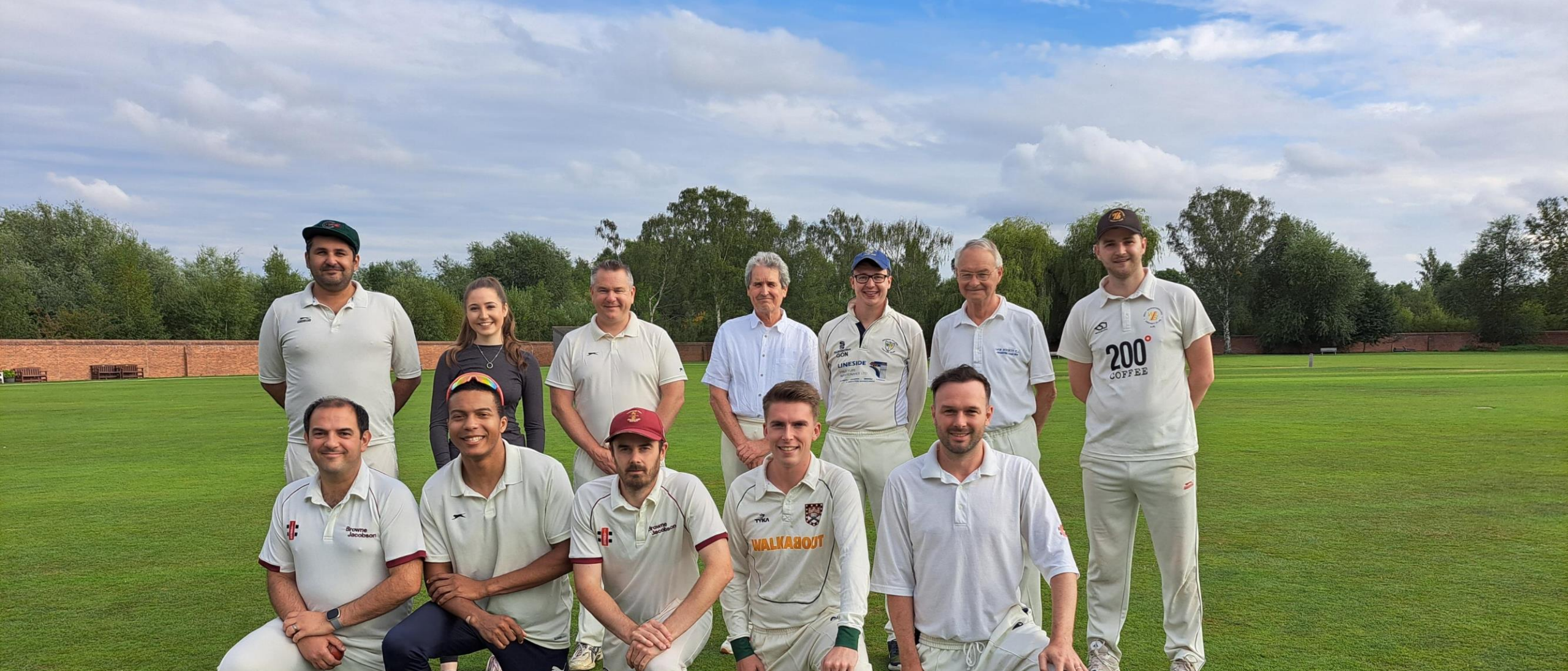
Nottinghamshire Law Society – Battle of the A52 Cricket Team