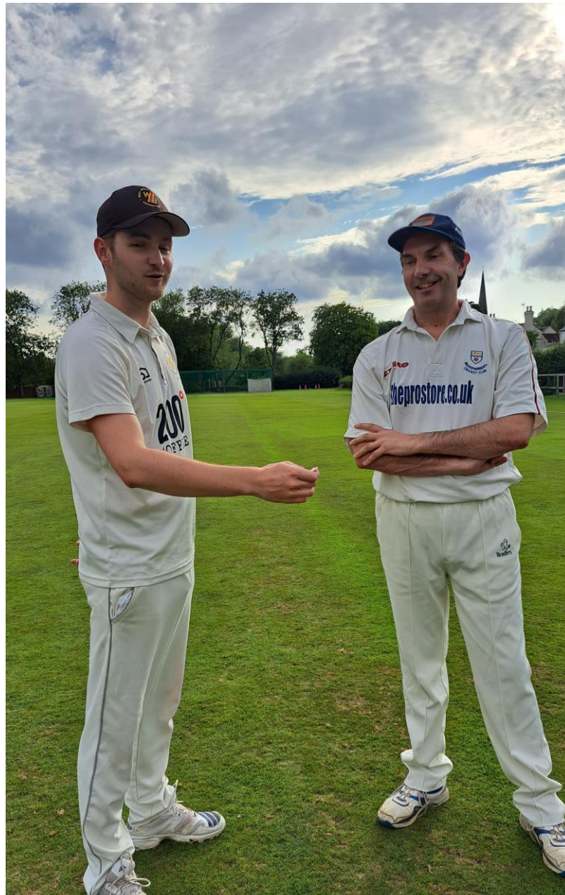
Nottinghamshire to open batting...