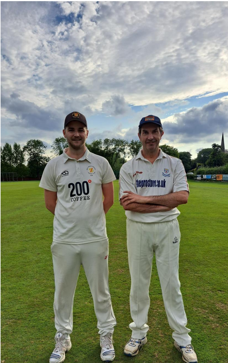
The coin toss....