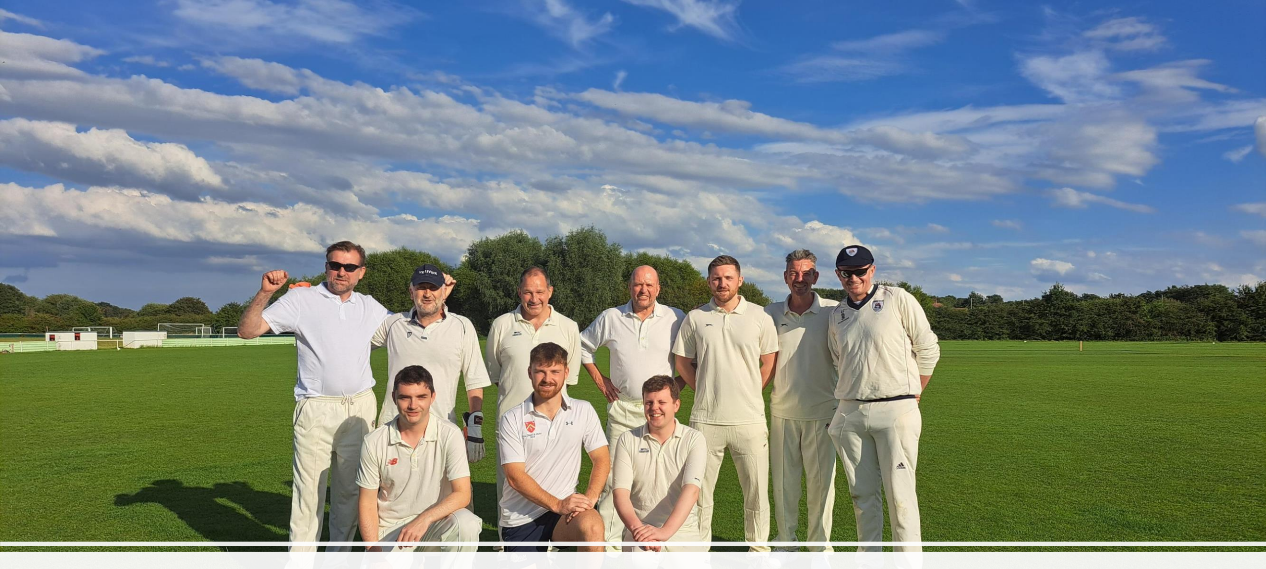
The Barristers' Team 2023