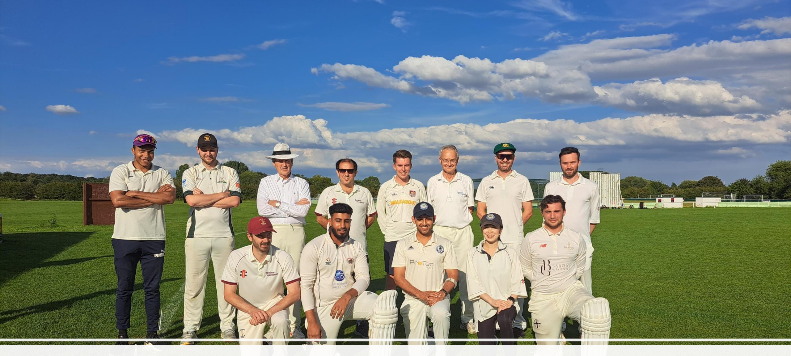
The Solicitors' Team 2023