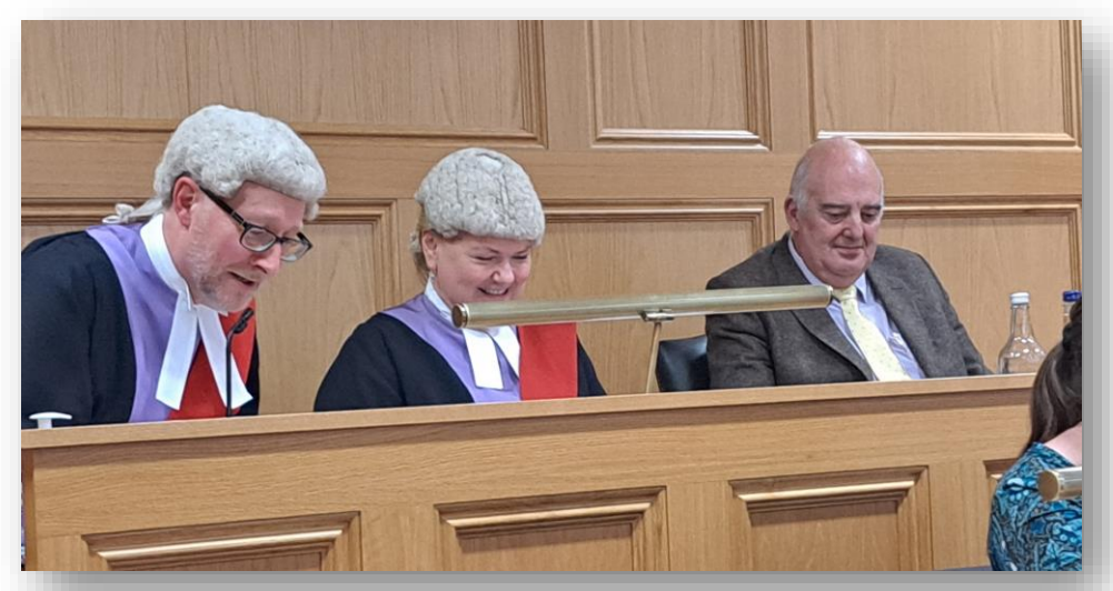
HHJ Coupland, HHJ Coe KC and JP Massarella